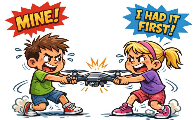
Copilot (2026) cartoon image of two kids fighting over a drone? [AI generated image]