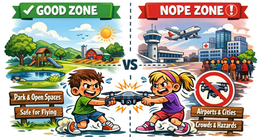
Copilot (2026) drone flight “good zone” vs. “nope zone.” [AI Generated Image]