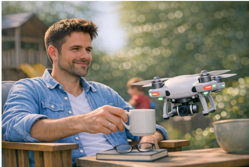
Copilot. (2026). Calm parent picking up coffee cup while drone hovers nearby [AI-generated image]. Microsoft.